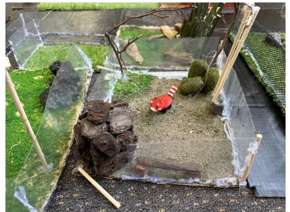
Red Panda enclosure