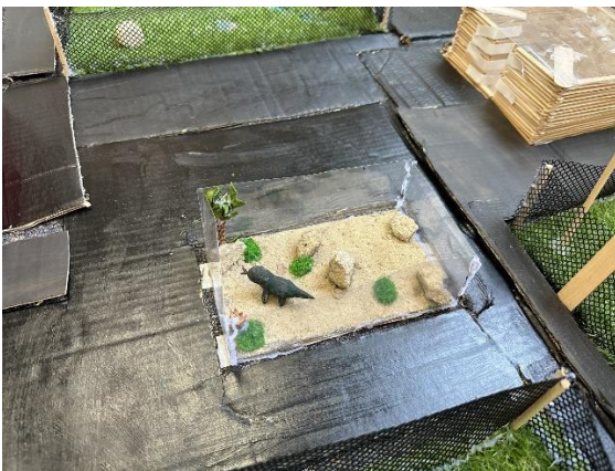
Komodo Dragon enclosure

To promote our zoo we have made many podcasts like one with all the board members that we made a few days ago to talk about our zoo (but there's nothing better than seeing it in person). We also had debates with our peers about weather zoos should exist or not, and lets just say that a lot of our class thought that they should not exist because a lot of zoos around don't treat their animals properly and in the right way so our class wanted to make a zoo to change all those things happening and to make an ETHICAL zoo that changes all the harm that zoos do to animals.