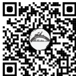
Link to the website